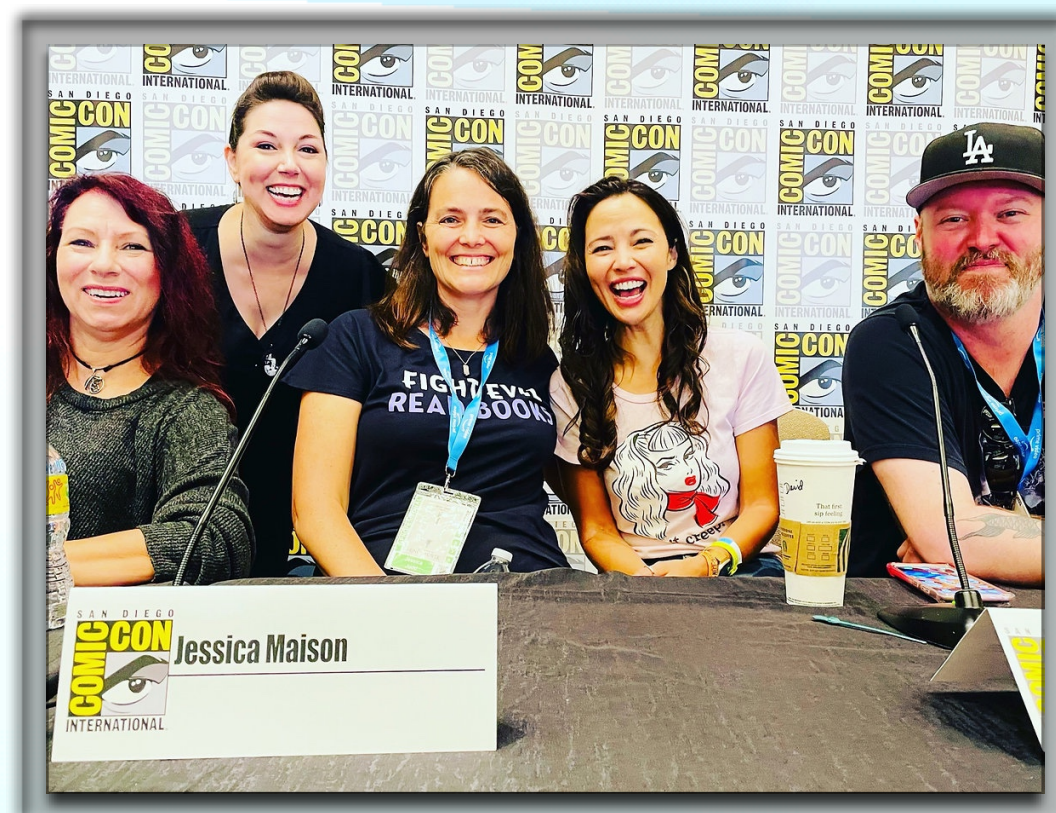
SD Comic Con 2022