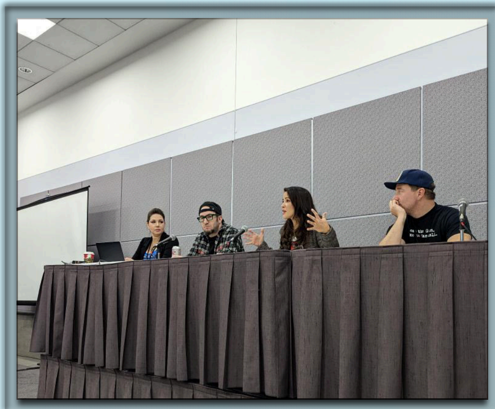
Wonder Con 2022